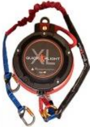
Model QFXL150-20A (20m) with 1m, 2m ripcord