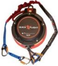
Model QF150-12A (Low mount and Standard 12.5m) with 1m, 2m ripcord